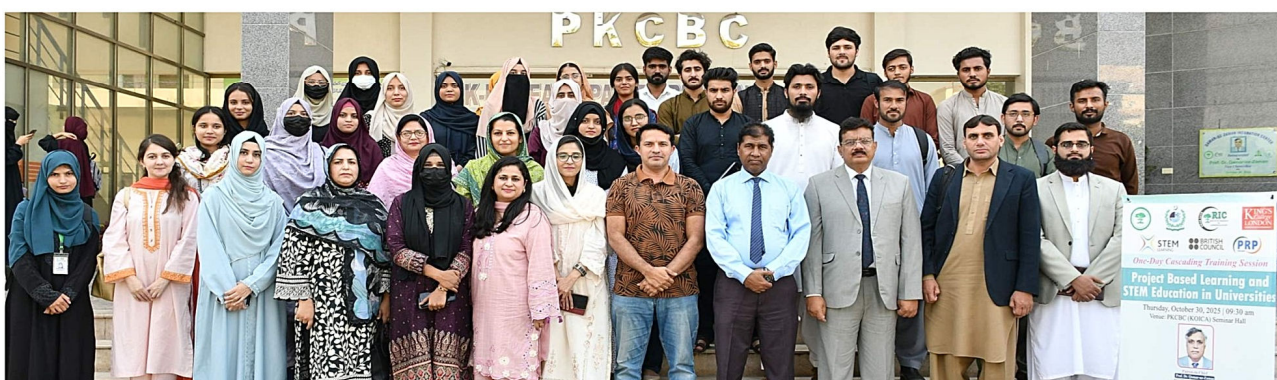
Seminar on Creating Culture of Research Excellence organized by the Department of Chemistry, PMAS-AAUR