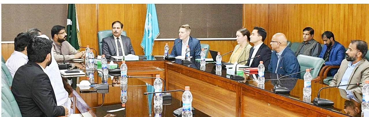
Delegation from Denmark Visited PMAS-Arid Agriculture University Rawalpindi