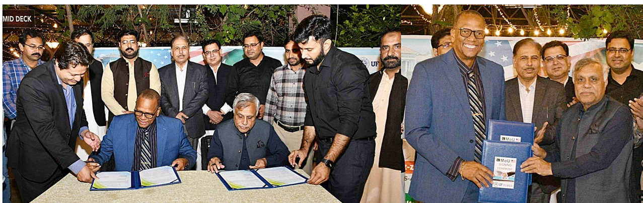
PMAS-AAUR and University of Florida USA Signed MoU