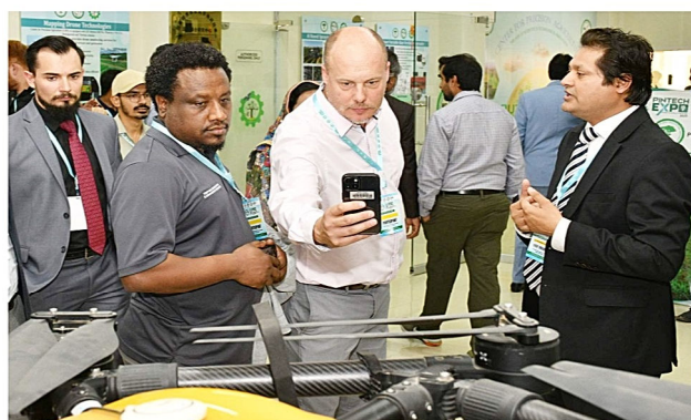
International Speakers Visiting Center for Precision Agriculture