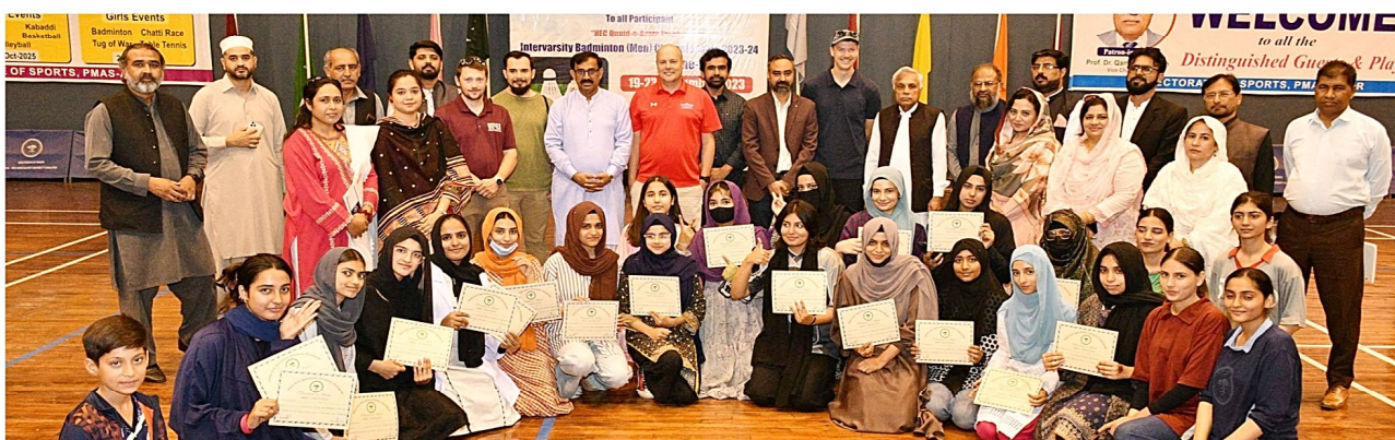
Sports Exhibition Matches held at PMAS-Arid Agriculture University Rawalpindi